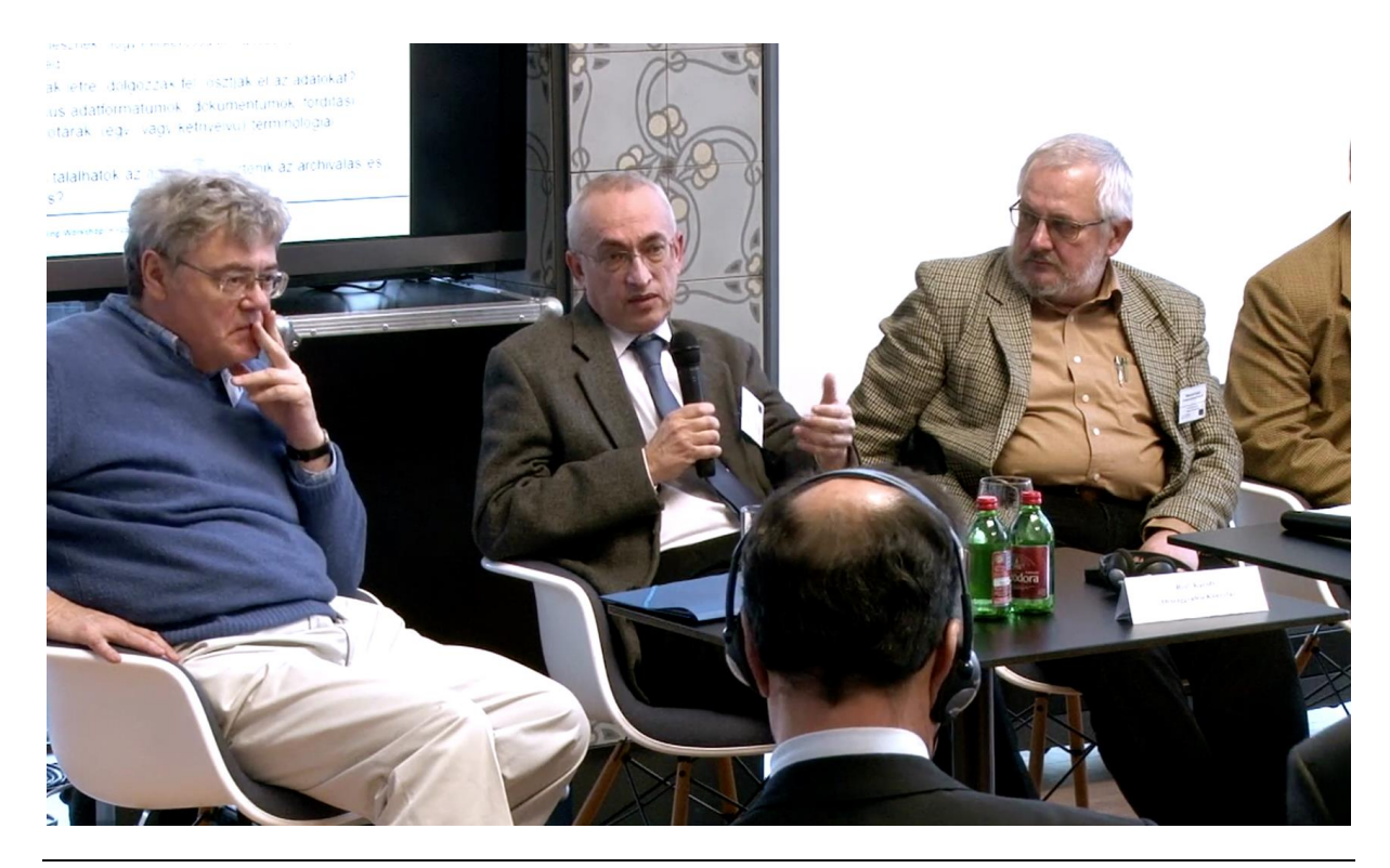
Figure 5 Photo of the Panel 2