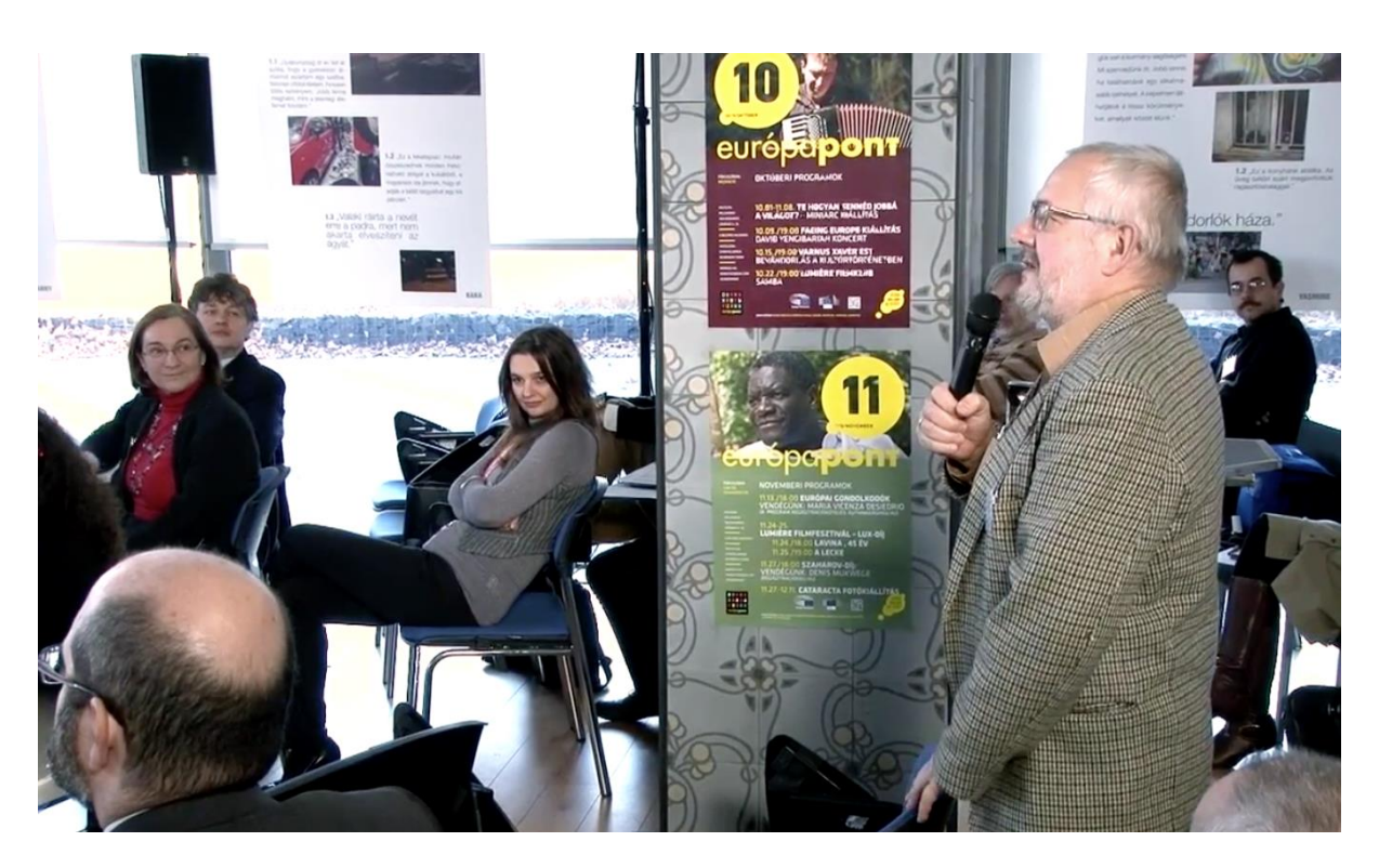
Figure 3 Photo 1