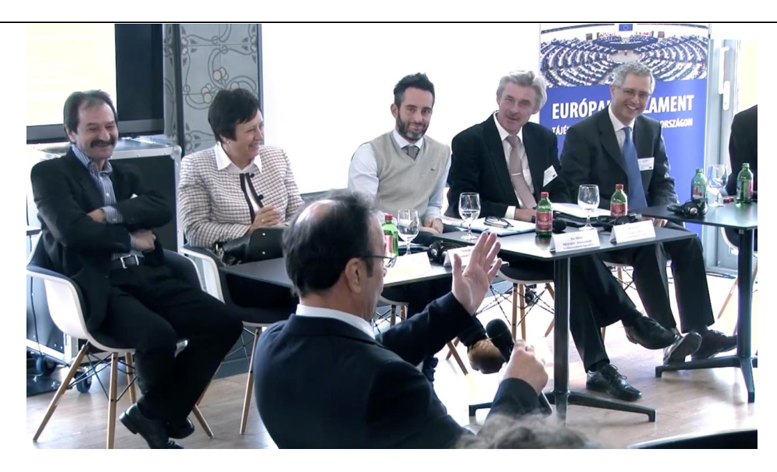
Figure 4 Photo of the Panel 1