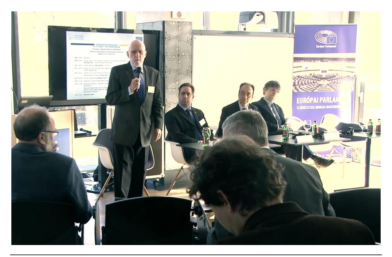
Figure 15 Photo of the Opening