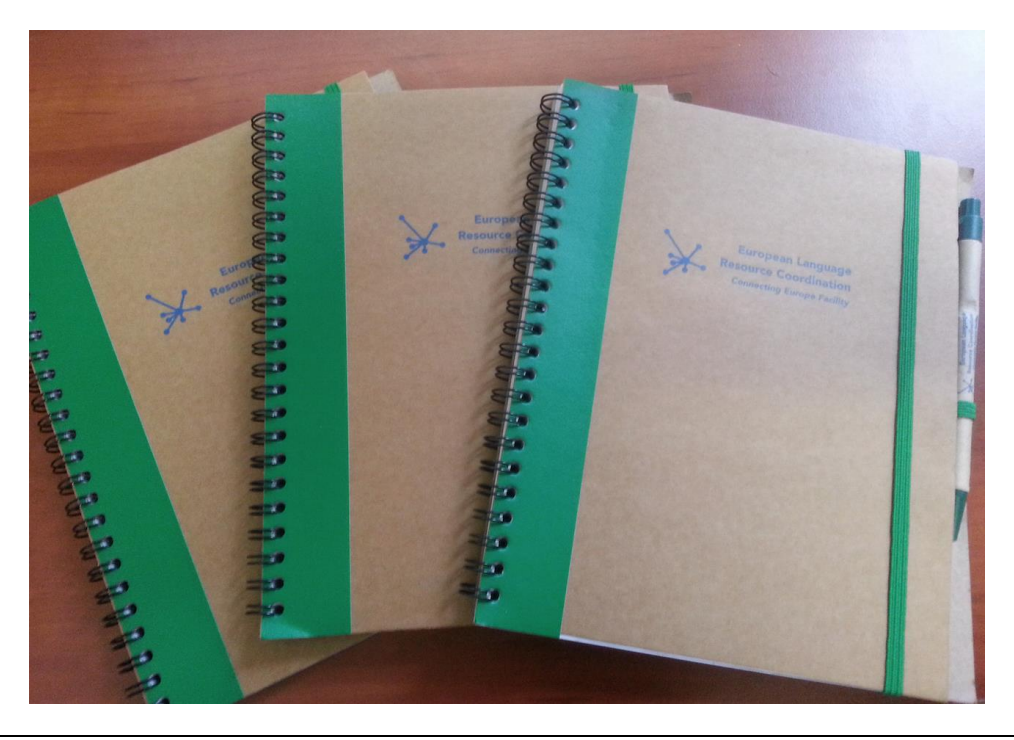
Figure 2 Notebook and pen with ELRC logo