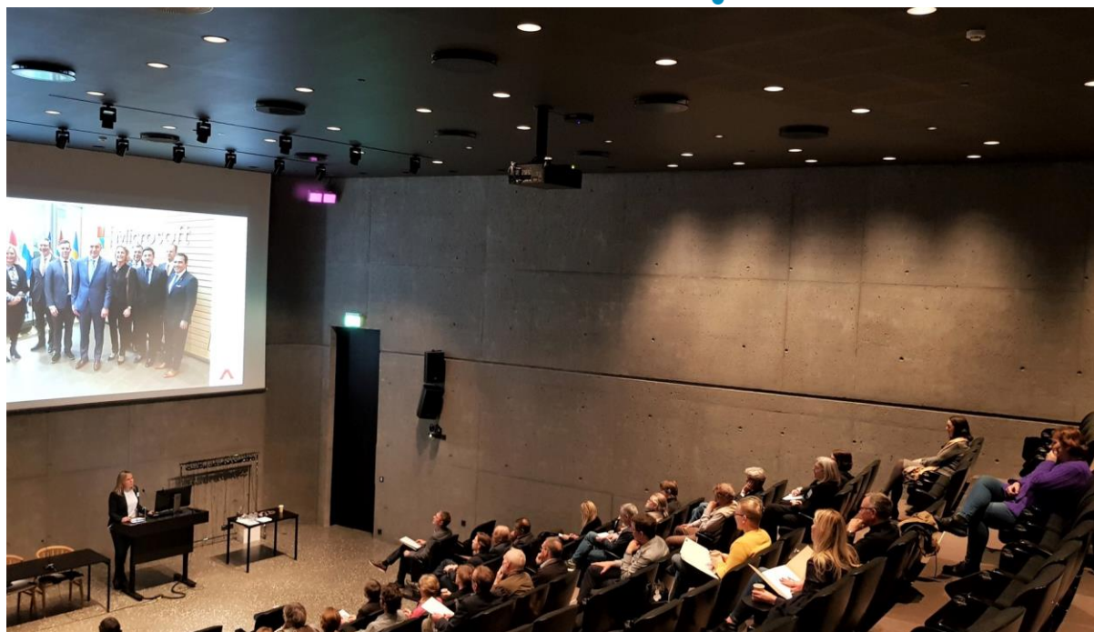
Image 3 ELRC Workshop in Iceland on 28 September

Most participants work within or close to the machine translation business, translation services and the language sector.