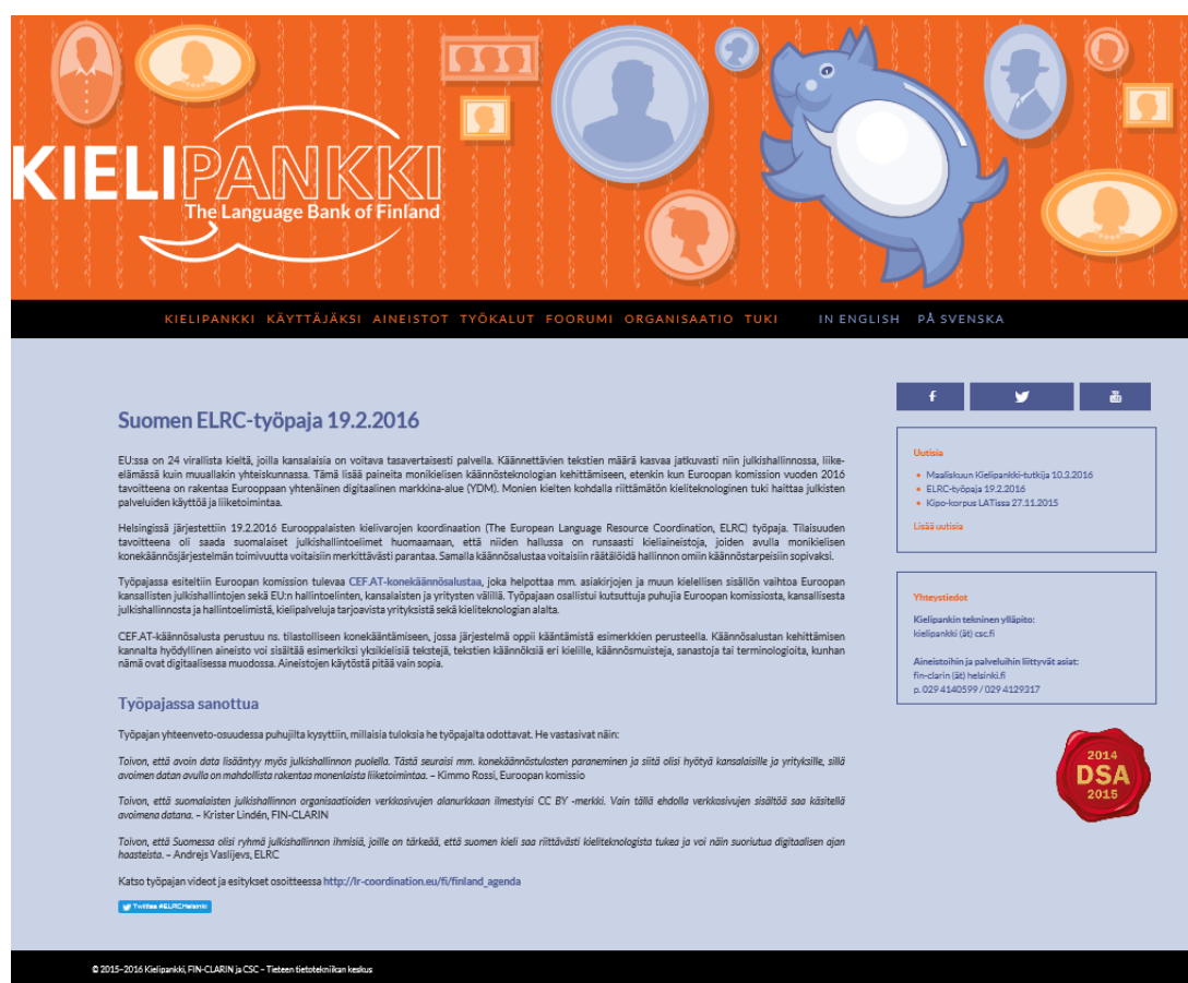
Picture 3 Snap-shot of press release

In order to reach that segment of the Finnish media that might be interested in the topic of the workshop FIN-CLARIN contacted the Press Officers of the Faculty of Arts of the University of Helsinki and of the Department of Modern Languages of the university and asked them to send the email containing the link to the press release to their contacts. The Press Officers however suggested to have a meeting with FIN-CLARIN on March 16 about a communication strategy regarding possible dissemination activities. FIN-CLARIN accepted the suggestion, thus after March 16 we will be able to give more information regarding this issue.